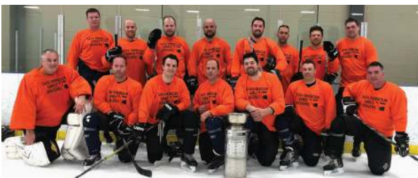
Congratulations to our 2018-19 Winners